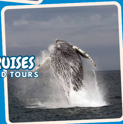
MARINER CRUISES WHALES & SEABIRD TOURS