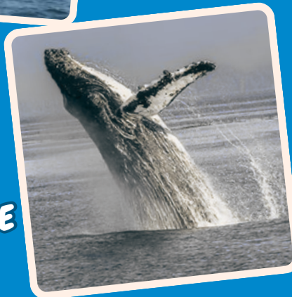
PETIT PASSAGE WHALE WATCH