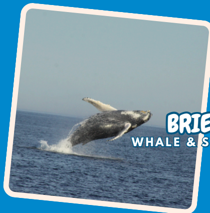
BRIER ISLAND WHALE & SEABIRD CRUISES

+1-902-839-2346 / 1-800-239-2189 whales@novascotiawhalewatching.ca June 13th – September 30th