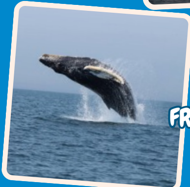
FREEPORT WHALE & SEABIRD TOURS