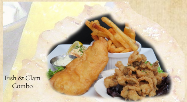
Fish & Clam Combo

Clubhouse - $19 bacon, tomato, turkey, baby greens dressed with mayo & cheese