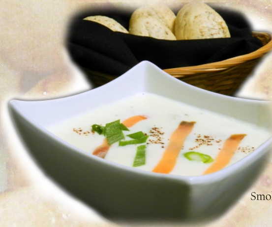
Scallop & Smoked Salmon Chowder