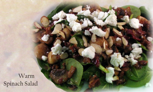
Warm Spinach Salad

The quality of your meal relies on the time taken to prepare it carefully. We thank you for your patience and your patronage.