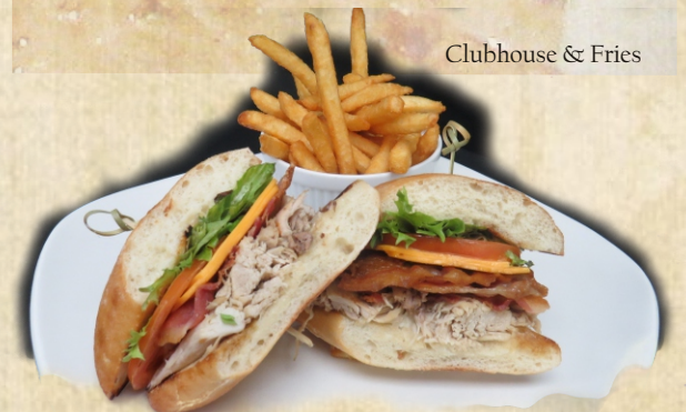
Clubhouse & Fries