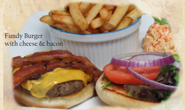
Fundy Burger with cheese & bacon