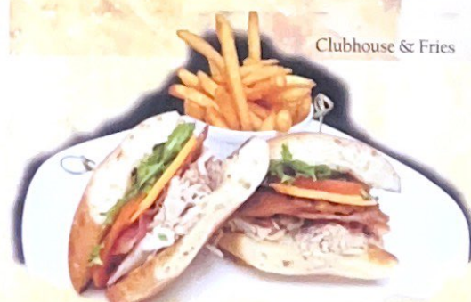
Clubhouse & Fries