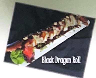
Black Dragon Roll