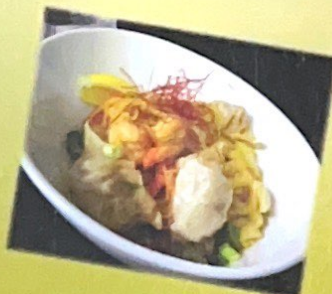
Stir Fry Noodles