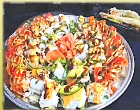
Ask your server about Sushi Platters