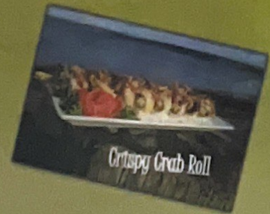
Crispy Crab Roll