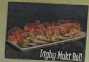
Digby Maki Roll