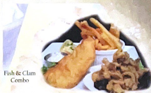
Fish & Clam Combo

Clubhouse - $18 bacon, tomato, turkey, baby greens dressed with mayo & cheese