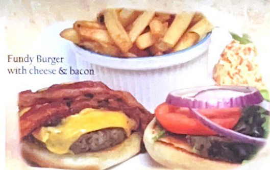
Fundy Burger with cheese & bacon