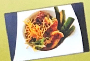
Chicken Teriyaki Bowl

Please note: Prices do not include tax or Gratuity February 2024